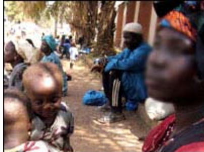
Many women feel let down by the justice system

Fighters from all sides have used sexual violence as part of a deliberate strategy to instil terror in and to humiliate the population, Amnesty says.