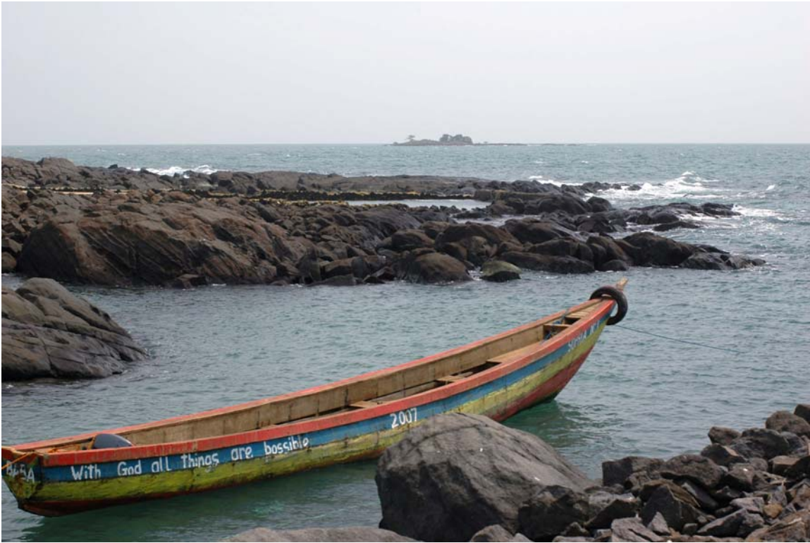
Fishing boat moored at Kent, with Ricketts Island on the horizon.