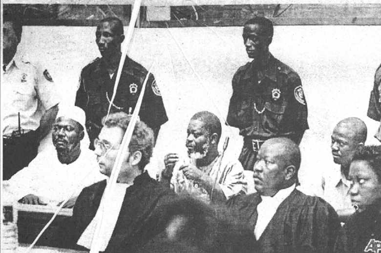
Some of the convicts Morris Kallon, Augustine Gbao, and Issa Hassan Sesay, seated left to right in the 2nd row