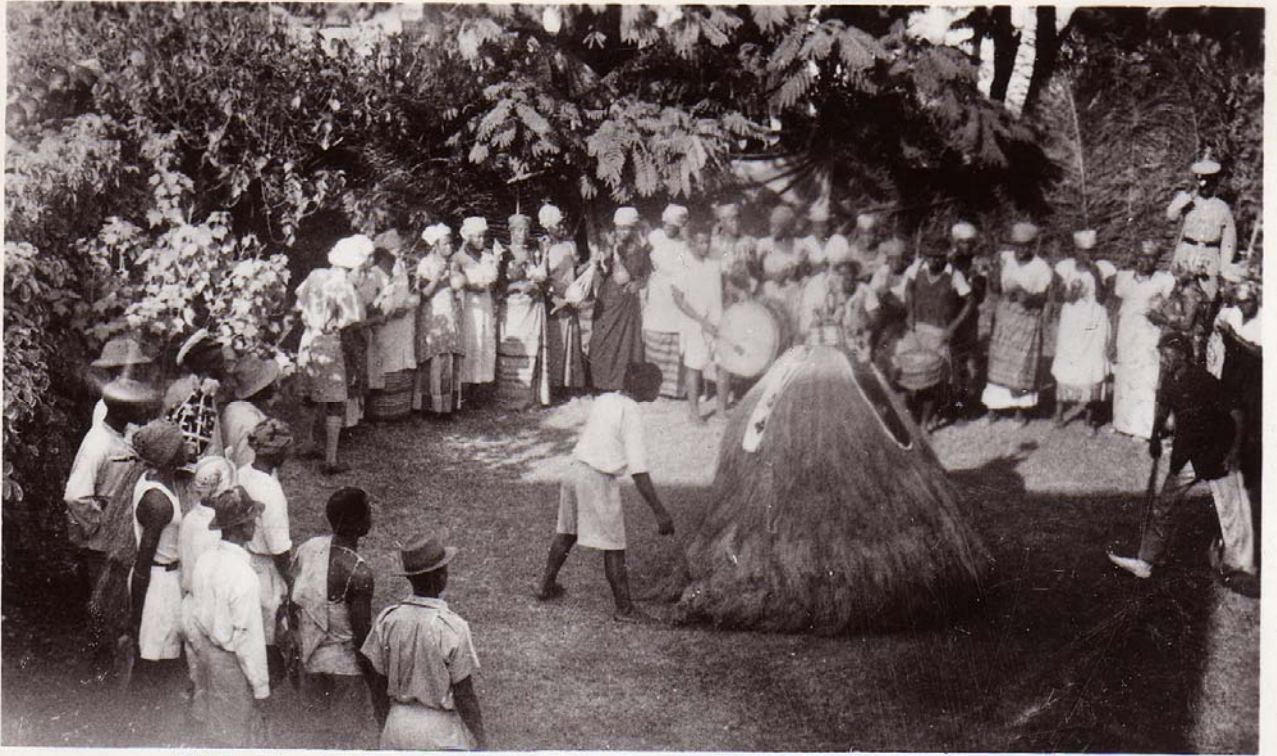
GOBOY, THE WITCH DOCTOR, DANCING TO A MELODIOUS MUSIC. SIERRA LEONE.

Historic postcard. Outreach experts agree that the Mende masked devil pictured is Jobai, not Goboy.