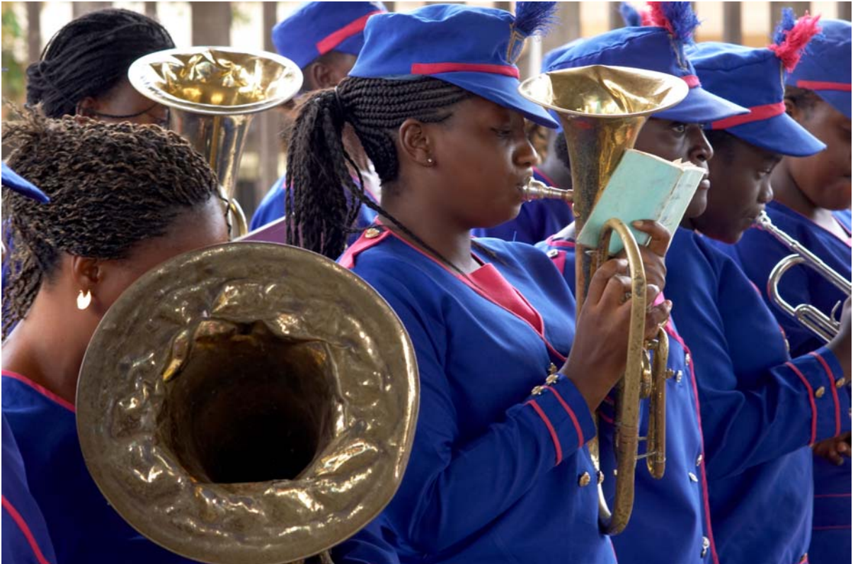
Members of the St. Joseph's Secondary School (Convent) band stand to play the national anthem.