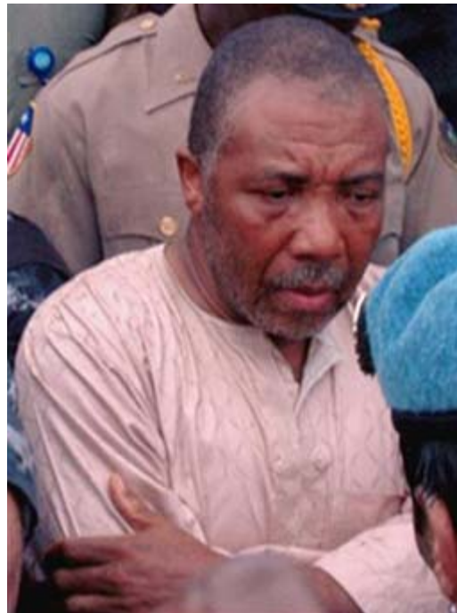
Former President Charles Taylor

Foreign Secretary Margaret Beckett said last June that London had agreed to a request by the former UN secretary general Kofi Annan that if Taylor were convicted, he would serve his sentence in Britain.