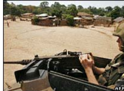
Peacekeepers have stopped the rival armies clashing

He spoke for many Ivorians when he told the BBC he feared both President Gbagbo and Mr Soro had hidden agendas which would compromise the chances of free and fair polls.