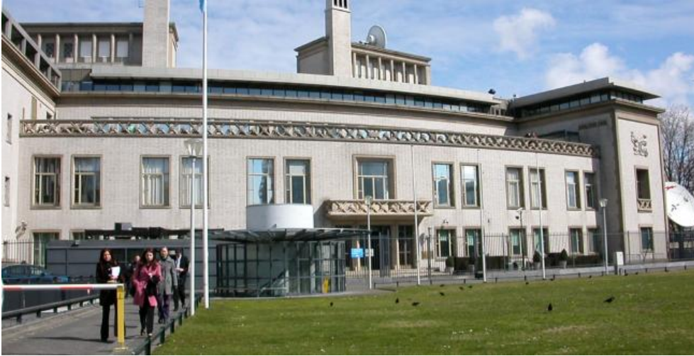
New York, United States of America

The Security Council today extended the mandates of the United Nations tribunals set up to deal with the worst atrocities committed during the Balkan conflicts of the 1990s and the Rwandan genocide of 1994.