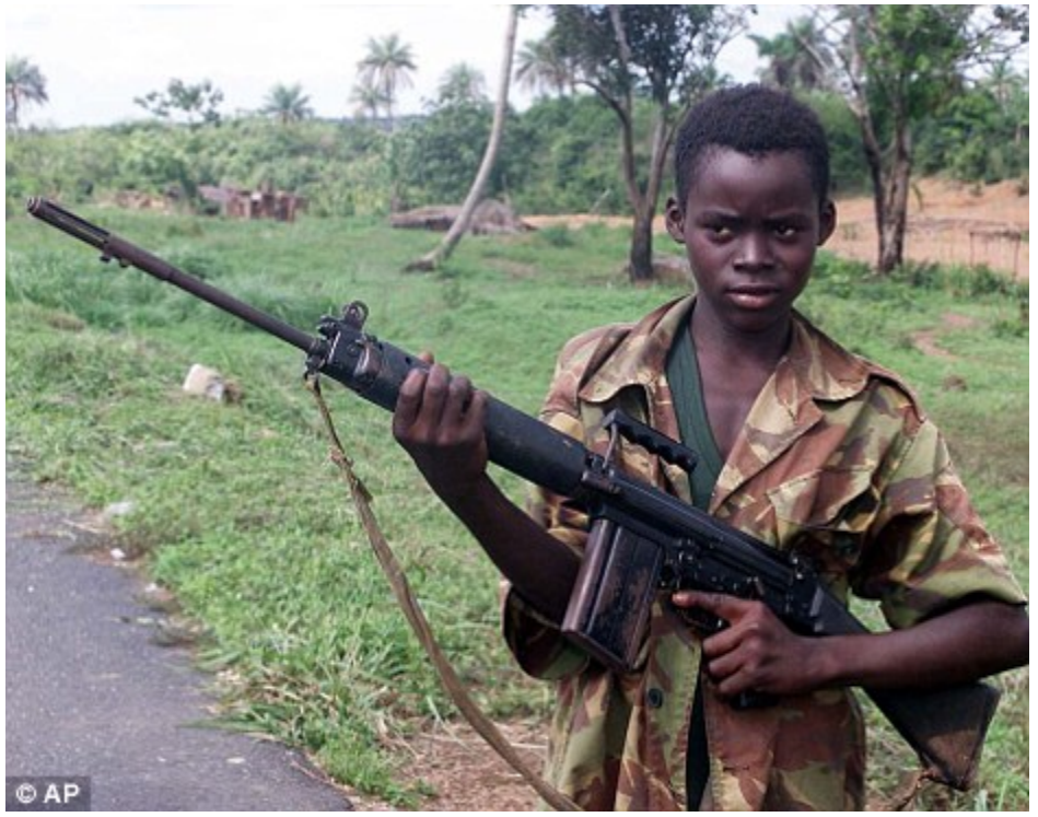
Crimes: Taylor was found guilty of conscripting child soldiers during the decade-long Sierra Leone civil war