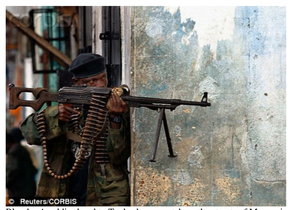
Bloody: A soldier loyal to Taylor keeps watch on the streets of Monrovia during fighting

a fighter loyal to Taylor keeps watch on the streets of Monrovia