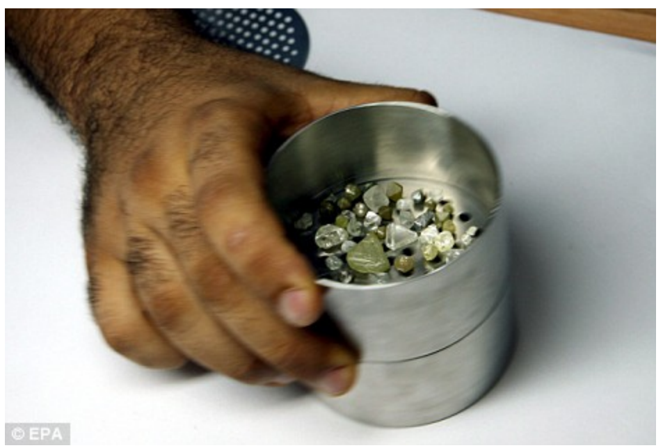
Country's gems: Diamonds from Koidu town in eastern Sierra Leone, which sparked horrifying civil war that would later inspire the film Blood Diamond

The lesson is 'if you are a small, weak nation, you may be subject to the full force of international law, whereas if you run a powerful nation you have nothing to fear,' Griffiths said.