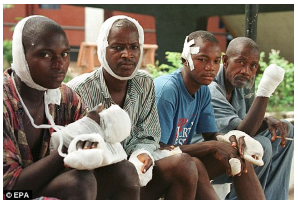
Attacked: Victims of the brutal crimes committed during the Sierra Leone civil war nurse their wounds