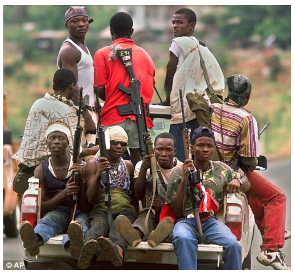
Chaos: The decade-long civil war saw tens of thousands of people killed and many more horrifically mutilated during the bloody conflict

a fighter loyal to Taylor keeps watch on the streets of Monrovia