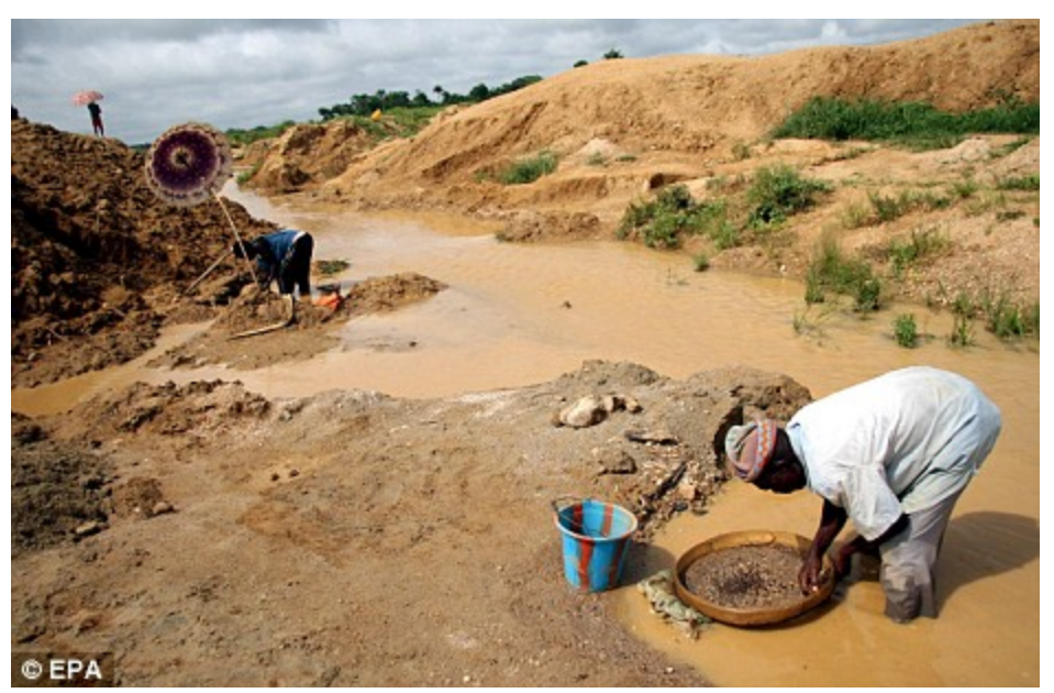
Real prize: Miners from Sierra Leone wash gravel in large sieves looking for rough diamonds

But the reality is that while many Western countries have funded militias that have committed atrocities, no Western leader has ever been indicted by a war crimes tribunal, he said. Miners from Sierra Leone wash gravel in large sieves looking for rough diamonds