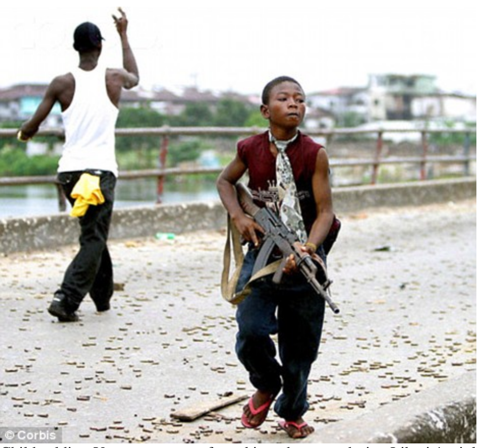
Child soldier: Youngsters were forced into the army during Liberia's violent civil war, where women were held as sex slaves and civilians had limbs hacked off with machetes