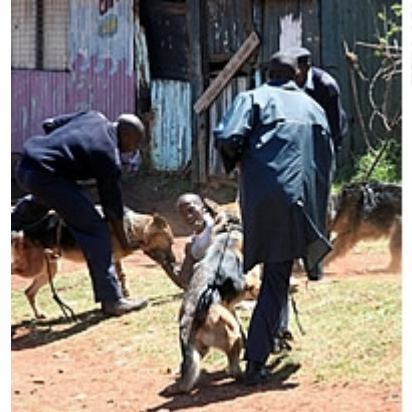
A man believed to be a protester is brought down by police dogs near the town of Kikuyu after a group from the Kikuyu tribe blocked the road connecting Kenya's capital with the Rift Valley town of Naivasha, 30 Jan 2008