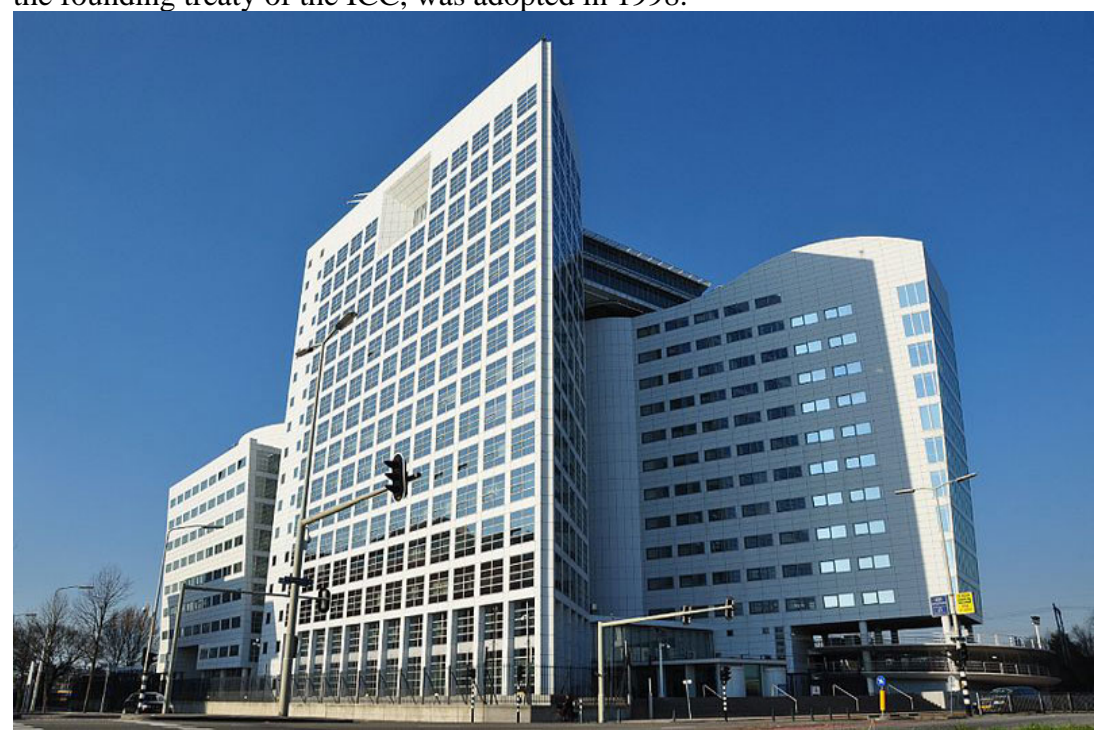
Headquarters of the International Criminal Court in The Hague.

International Criminal Justice Day is dedicated to celebrating the development and achievements of international criminal justice institutions. It is observed on 17 July, the date on which the Rome Statute, the founding treaty of the ICC, was adopted in 1998.