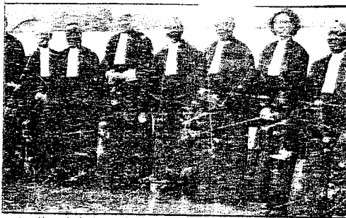
the Special Court judges to decide guilt or innocence