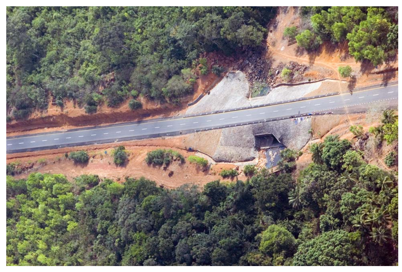
The peninsular highway