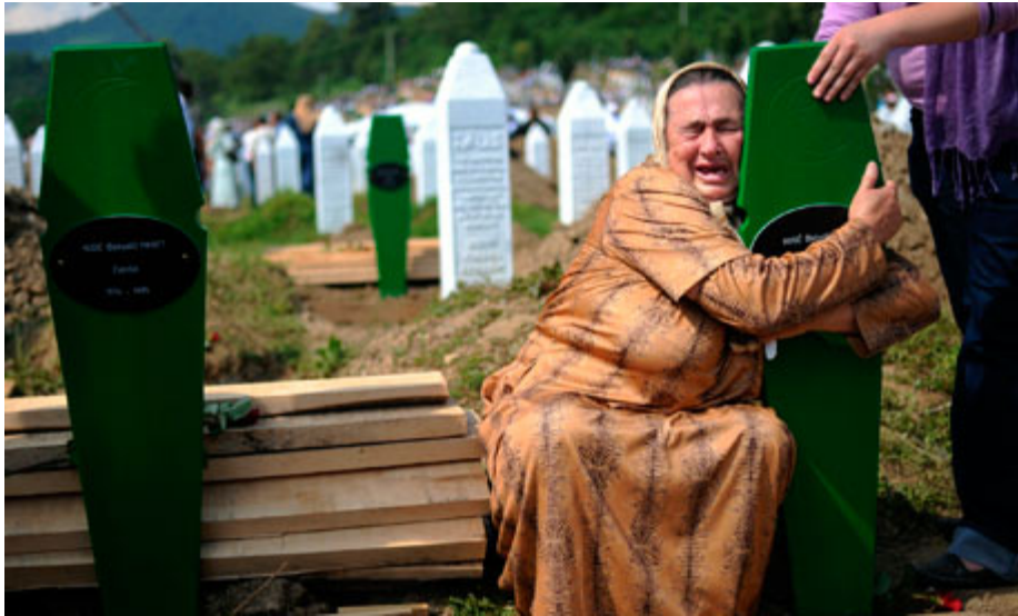
A Bosnian woman cries over newly dug graves of her two sons during preparation in July 2010 for the mass burial of victims of the Srebrenica massacre.

ICC may seem Africa-centric, but hopefully this will come to be seen as teething problems in creating legitimate global judiciary