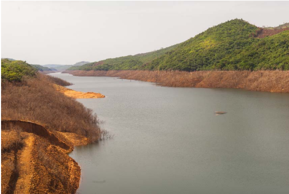
The Bumbuna Reservoir

Enclosed are clippings of local and international press on the Special Court and related issues obtained by the Outreach and Public Affairs Office