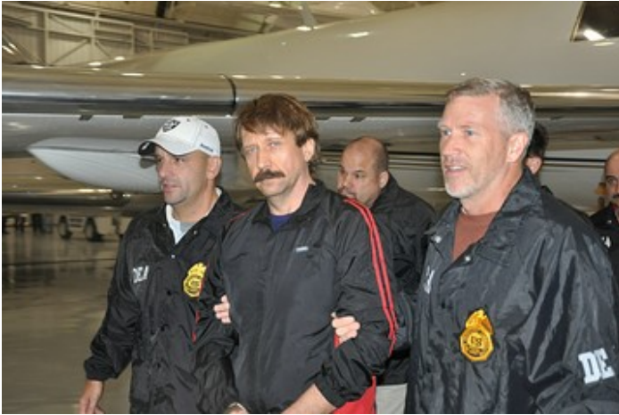
Viktor Bout deplanes after arriving at Westchester County Airport.

Viktor Bout, the alleged Russian arms dealer whose reported escapades inspired the film “Lord of War,” pleaded not guilty in a New York court to charges that he agreed to supply Colombian terrorists with weapons with the intent to kill Americans.