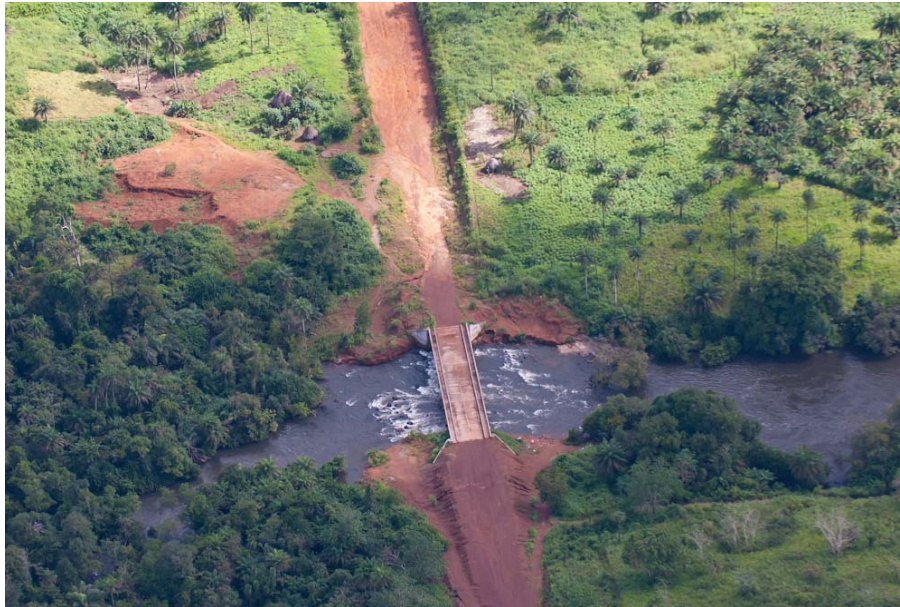
Aerial view of a bridge in Biriwa chiefdom. Northern Sierra Leone