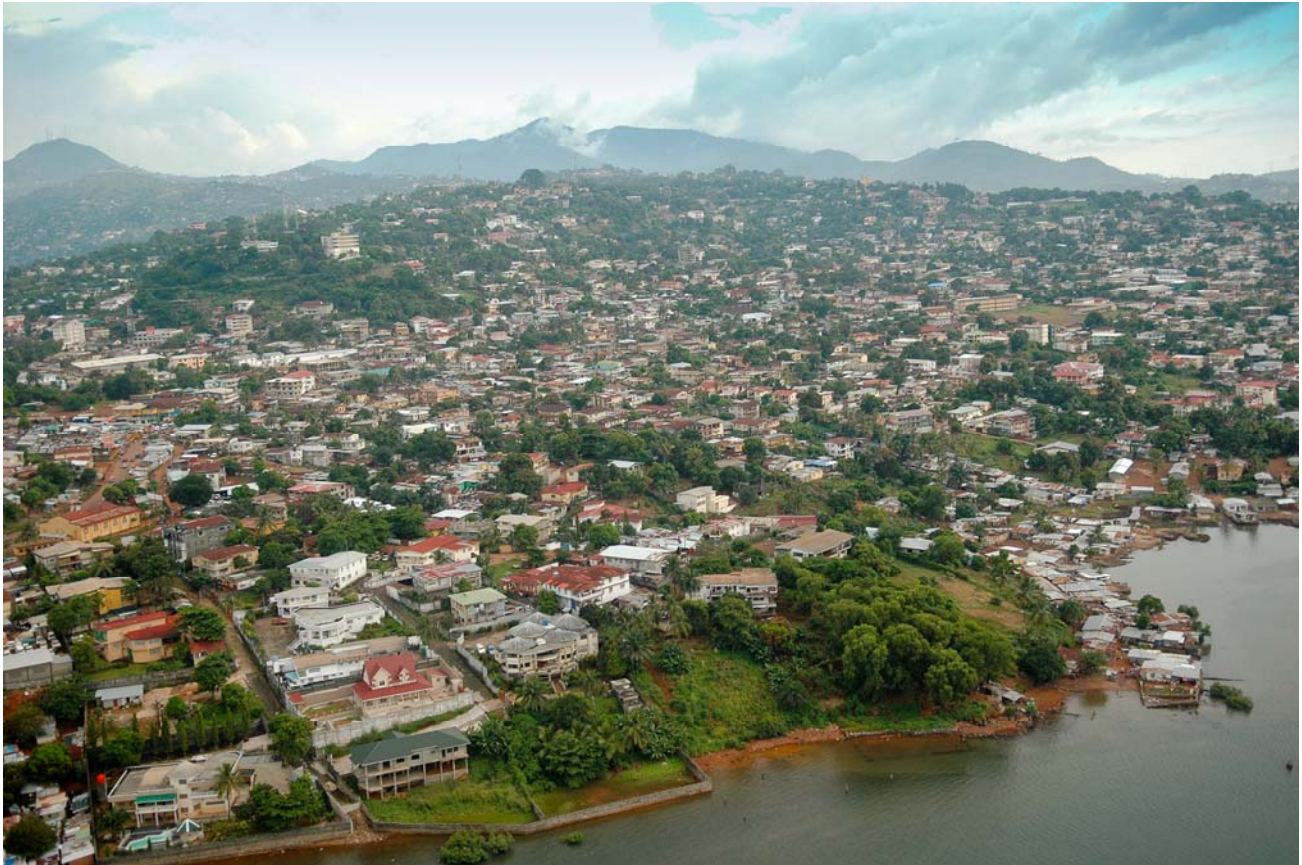
An aerial view of some parts of Western Freetown