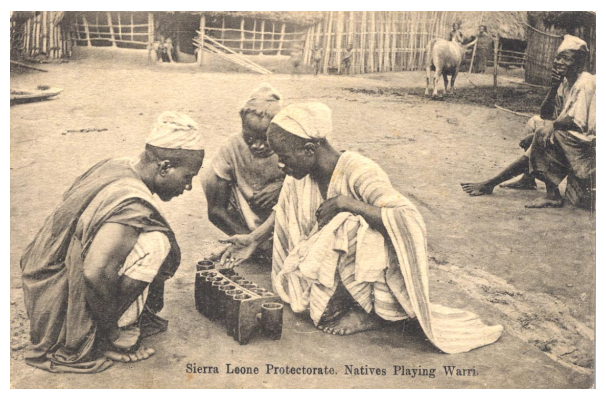
Historic postcard 'Natives playing warri'