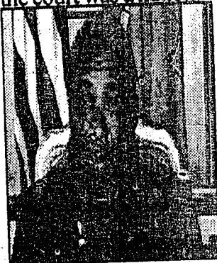
Taylor has been living in exile in Nigeria

Mr. Taylor's lawyers appealed even before his trial had begun. Among their arguments, they said the court was a national