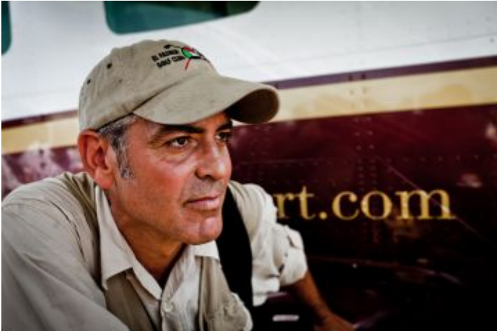
George Clooney in South Sudan in October 2010.

War crimes were committed by the northern Sudan Army when it seized the contested Abyei territory on the border between North and South Sudan, according to several experts who analyzed satellite photos of settlements that were attacked.