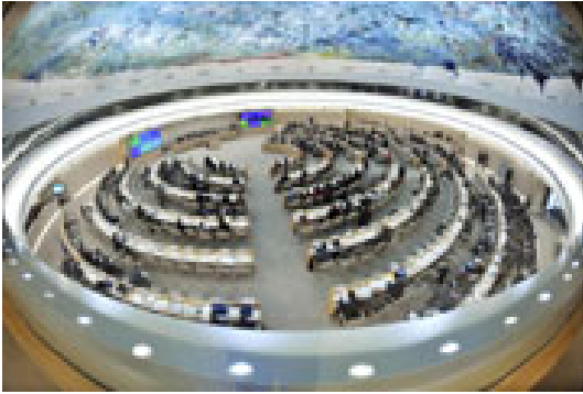
Human Rights Council, Geneva

A United Nations-ordered panel investigating human rights abuses in Libya says that Government forces have committed war crimes and crimes against humanity during the course of their crackdown on opposition forces seeking the ouster of Colonel Muammar al-Qadhafi.