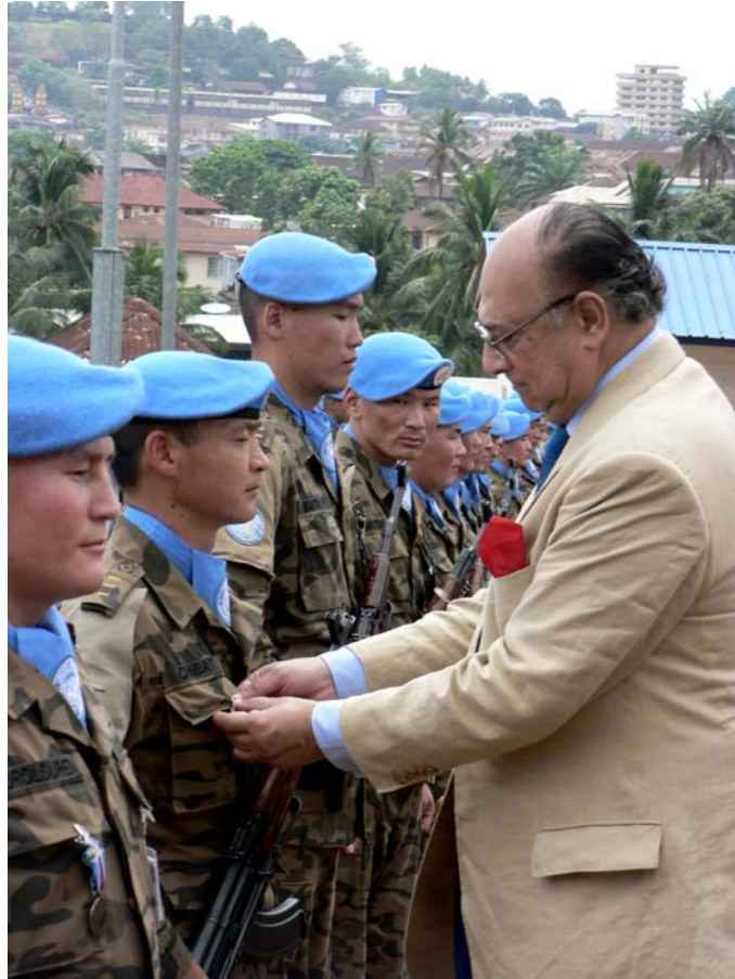
The Prosecutor presenting medals to members of the UNMIL's Mongolian Guard Force on Sunday, 30 April 2006