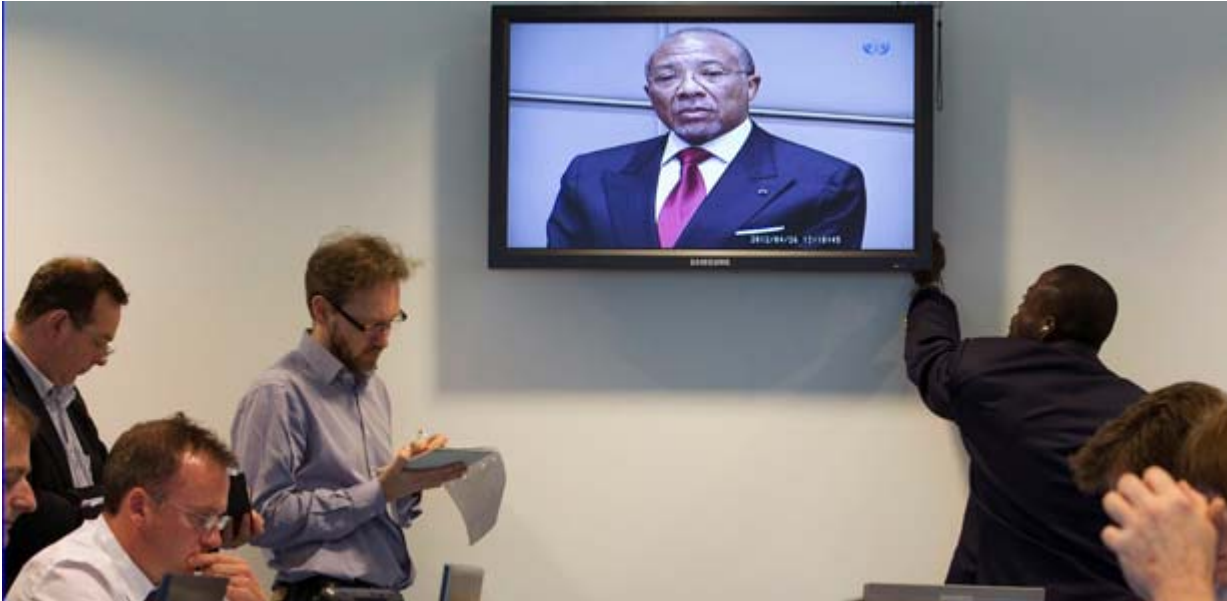
Journalists watch a closed-circuit broadcast of former Liberian leader Charles Taylor's trial as he hears the court's verdict.

Critics of the International Criminal Court often complain that it only targets abusive African leaders. But the truth is that the international justice system is inconsistent and arbitrary inside of Africa as well as outside.