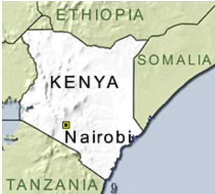
Nairobi in Kenya

One of the three foreigners on the nine-member Kenyan Truth, Justice and Reconciliation Commission (TJRC) said the commission has the power to recommend prosecution of those it would find committed violations of both international and Kenyan law.