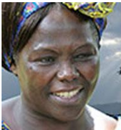
Nobel Laureate Wangari Maathai