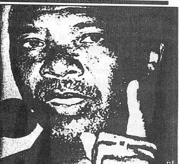
Taylor:test case for Special Court for Sierra Leone the bestial forces of Sankoh's Revolutionary United Front (RUF).