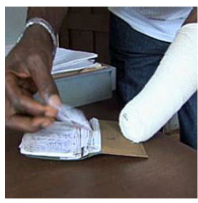
Victims must show identification or paperwork proving he or she was wounded in the war

To register, a photo is taken of the alleged victim and their family members, and they must give an oral testimony about what happened to them.