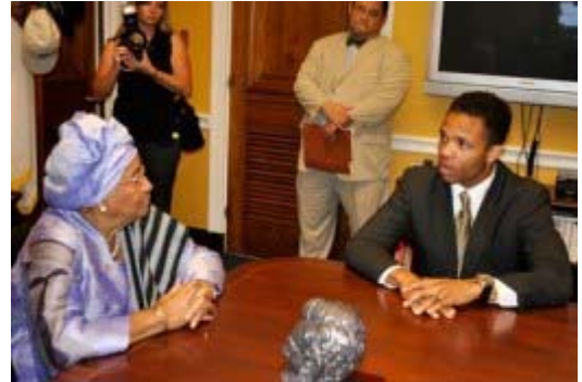
Executive Mansion President Ellen Johnson Sirleaf with Congressman Jesse Jackson Jr. (R-Illinois)

"As a nation with a vested interest in the continued growth and success of Liberia and the stabilizing role it plays in the region, we hope that our efforts to bring Charles Taylor to justice were not in vain," Jackson said.