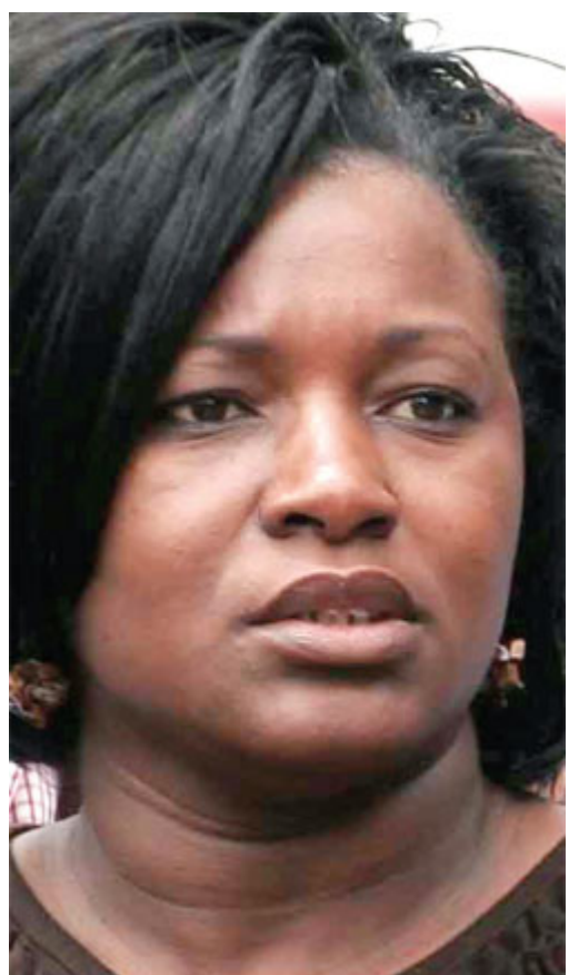
Nominated MP Rachel Shebesh

QUESTION: Do you consider the involvement of the ICC in Kenya good for the nation?