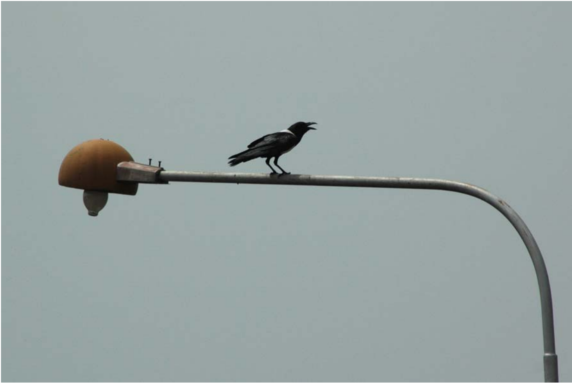
A Pied Crow, or "Minister Bird" takes in a football match at the National Stadium from the upper balcony.