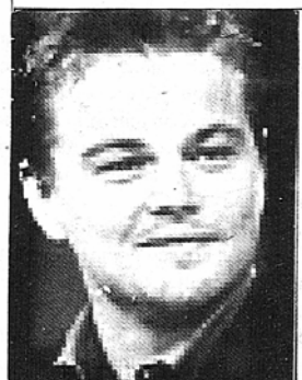
Di Caprio: brilliant performance

mond are the international diamond dealers who, as Danny Archer (Leonardo Di Caprio), the mercenary points out, 'don't actually fund the war.... but keep it boiling over for their profit'.