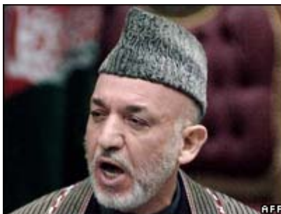
President Karzai is known to oppose the amnesty

Both houses have now backed the bill. It has yet to be signed by President Hamid Karzai, who could veto it.