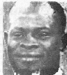
Hounsou: full of passion

Archer's determination to find the gem is more than matched by Solomon Vandy's love for his son