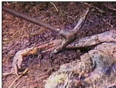
The mass graves were found in November last year

This is one of the few times armed men have been punished for atrocities since the DR Congo conflict began in 1997.