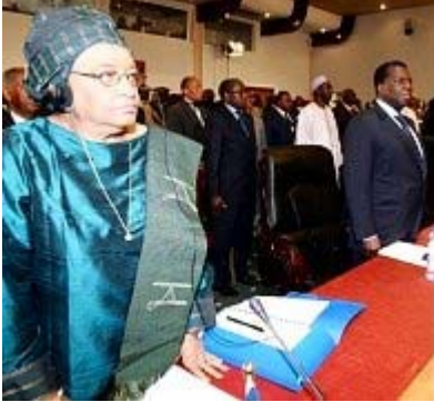
Liberian President Ellen Johnson Sirleaf attends opening session of ECOWAS summit, in Ouagadougou, Burkina Faso, 19 Jan 2007