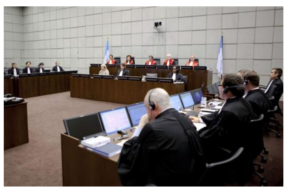
FILE - Judges, center, and the prosecution, right, take part in a special session of the UN-backed Special Tribunal for Lebanon at a court room in Leidschendam on November 11, 2011.

BEIRUT: Special Tribunal for Lebanon Prosecutor Daniel Bellemare will submit a new draft indictment in three cases to the pretrial judge before leaving office next week, several March 14 coalition sources told The Daily Star Sunday.