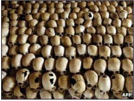
Some 800,000 people were killed in Rwanda's genocide

Sosthene Munyemana, 45, who had been working in a hospital in Bordeaux for eight years, denies the charges.