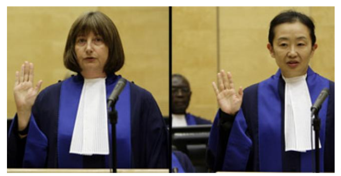
The Hague, Netherlands

The International Criminal Court has welcomed two new judges in a swearing in ceremony in The