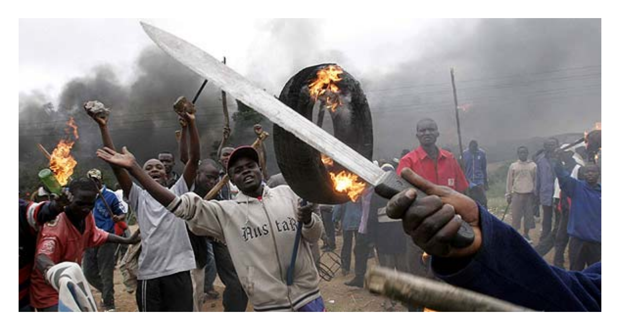
Opposition supporters burn objects and brandish crude weapons during protests at the height of the post- election violence.

Three spirited out by the ICC after ministry fails to assure their safety their safety