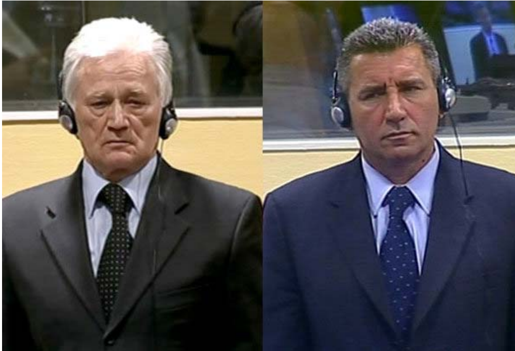
Both Momcilo Perisic and Ante Gotovina were released on appeal.