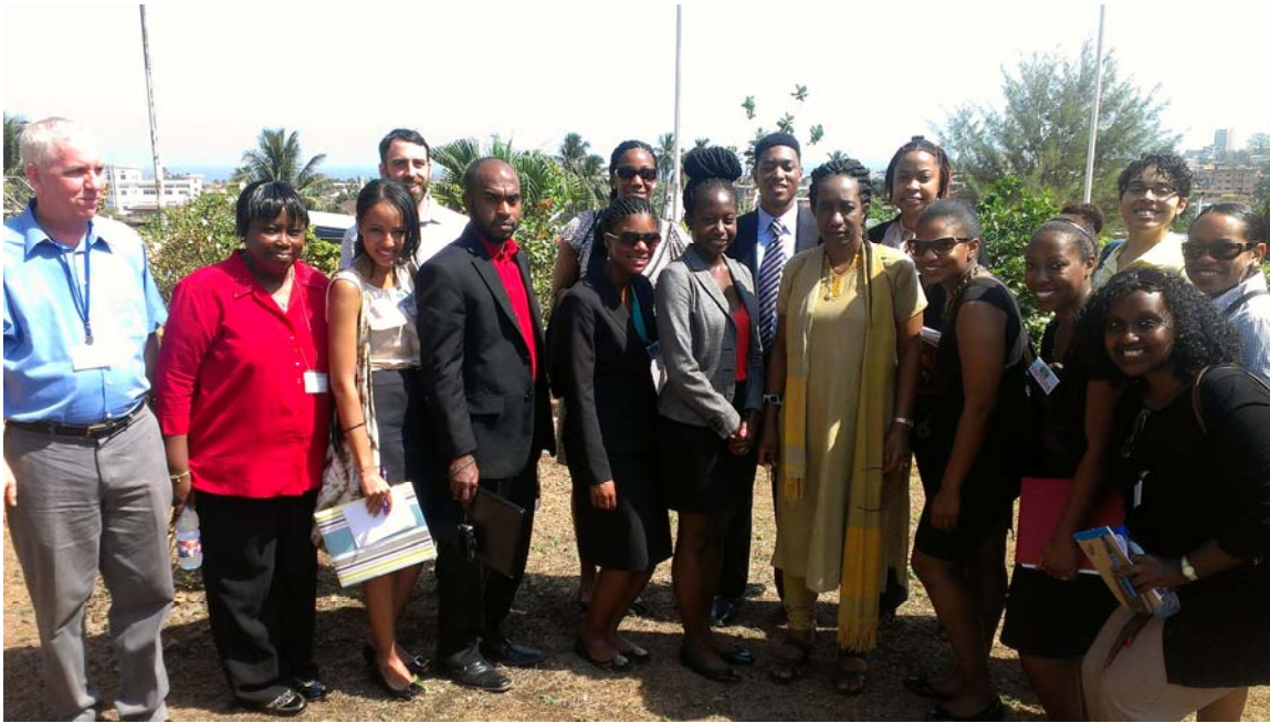
The Registrar and other Court officials with members of Harvard Black Law Students Association. For more photos, see today's 'Special Court Supplement'