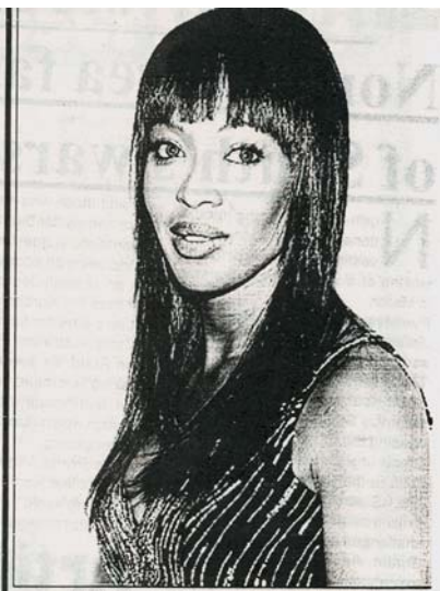
Model ... prosecutors pursue Naomi Big