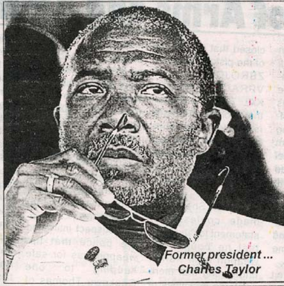
Former president ... Charles Taylor

T he Prosecution in the ongoing Charles Taylor case filed a motion yesterday asking that the Judges of Trial Chamber II issue a subpoena to compel model Naomi Campbell to testify in the