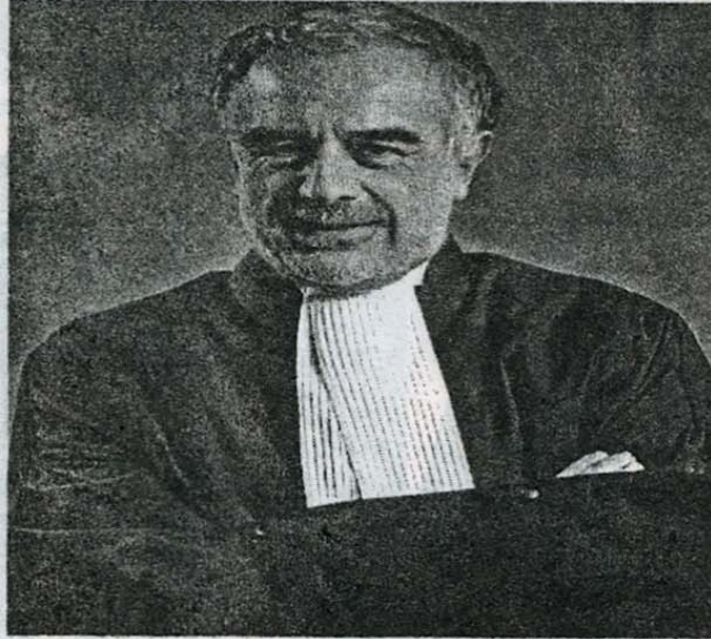
Moreno Ocampo: ICC Chief Prosecutor

From 19 to 21 May 2010, a delegation from the Office of the Prosecutor (OTP) of the International Criminal Court (ICC) is in Guinea to follow up on the mission carried out by the Deputy Prosecutor, Fatou Bensouda, in February this year. The OTP made public its preliminary examination in Guinea in October 2009. At the same time the international community unanimously called for accountability either through ICC or Guinean proceedings. Since then, the OTP has benefited from the full support of Guinean authorities as well as Regional and International Organizations. The purpose of this second visit is to liaise with Guinean judicial authorities and gather updated information on the on-going national investigation into the events of 28 September 2009. Guinea has been a State Party to the Rome Statute since 14 July 2003. As such the ICC has jurisdiction over war