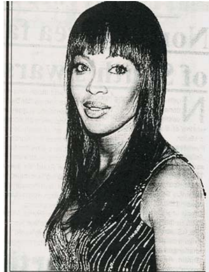
Model ... prosecutors pursue Naomi Big