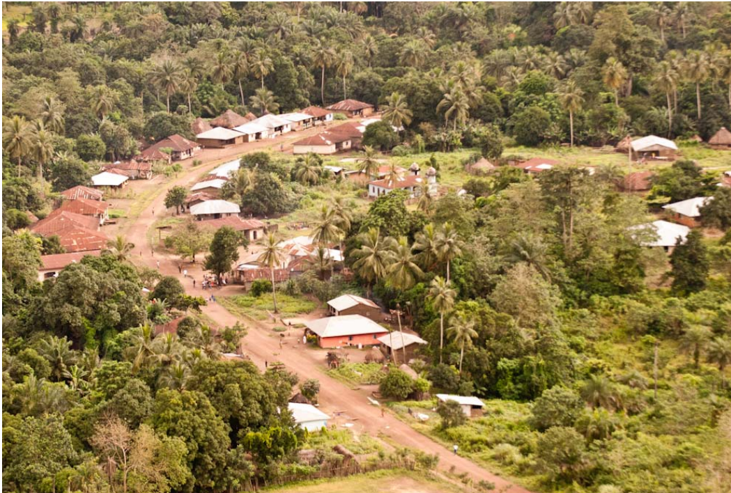
Aerial view of a village in Biriwa chiefdom, Northern Sierra Leone