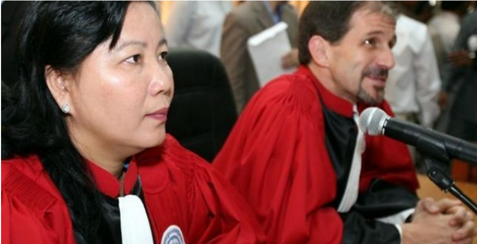
Phnom Penh, Cambodia

Prosecutors at the UN-backed Extraordinary Chambers in the courts of Cambodia (ECCC) on Tuesday demanded an increased sentence of life imprisonment for a former Khmer Rouge prison chief