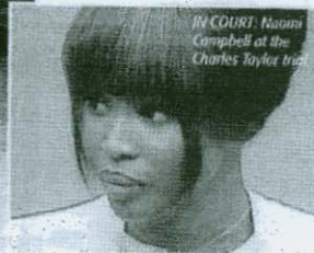
IN COURT: Naomi Campbell at the Charles Taylor trial