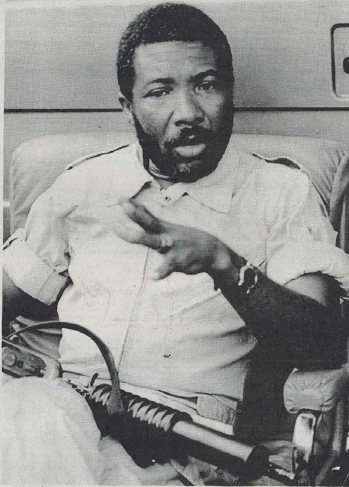
Former Liberian President, Charles Taylor is tried by the Special Court for war crimes committed during Sierra Leone's civil war