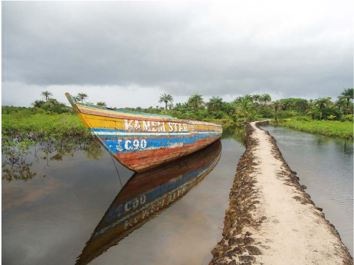
Pathway between Medina and Cotton Tree on the Lungi Peninsula.