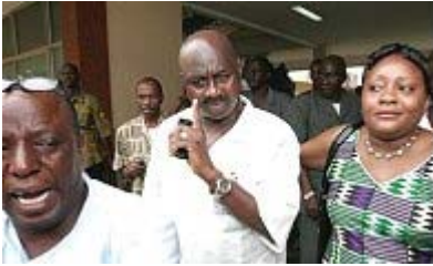
Union leader Ibrahima Fofana, center, declines to speak to the press as he leaves a meeting with government representatives in Conakry, 20 Feb. 2007

Union and government officials in Guinea have entered a second day of talks aimed at ending a strike that has led to weeks of political unrest.