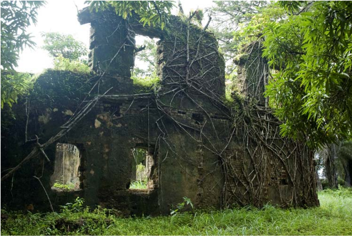
Ruins of historic slave-trading fortress at Bunce Island, near Freetown.