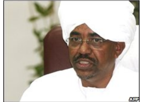
Mr Bashir is accused of masterminding the deaths of thousands in Darfur

Mr Moussa did not reveal any details of the Arab League's plan, but the organisation called for Sudan to hold credible trials for those accused of war crimes in Darfur.