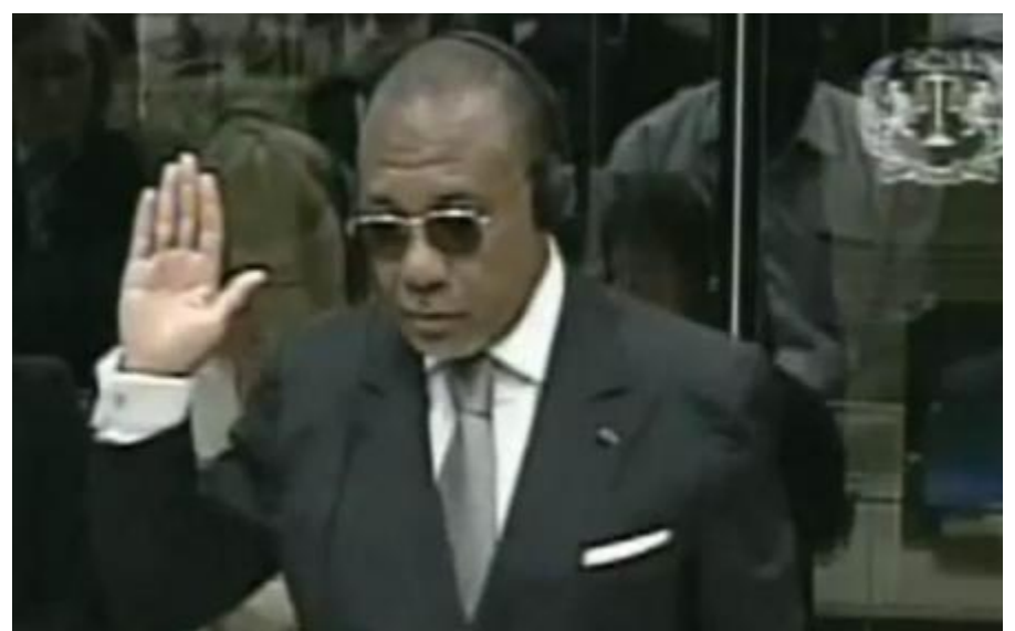
Charles Taylor prête serment devant le tribunal spécial pour la Sierra Leone

La condamnation de Charles Taylor par le Tribunal spécial pour la Sierra Leone (TSSL) le 30 mai 2012 est une première sans précédent. En effet, Charles Taylor a été condamné pour des faits commis en sa qualité d'ancien chef de l'Etat du Libéria, entre 1997 et 2003.