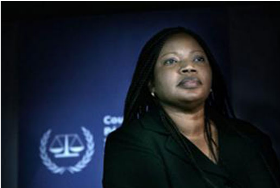
ICC deputy prosecutor Fatou Bensouda.

The deputy prosecutor of the International Criminal Court (ICC), Ms Fatou Bensouda, has said that the court cannot pursue former Chadian dictator Hissene Habré for alleged crimes against humanity.