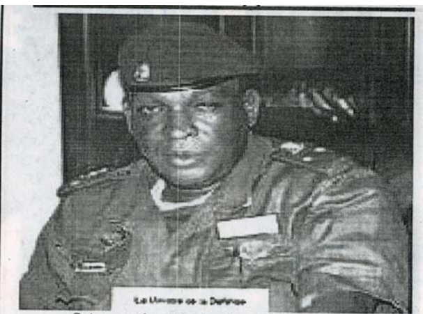
Guinean military leader General Sekouba Konate alias El Tigre (The Tiger).

Guinea's political and military leaders and the international community must take urgent measures to halt widespread attacks against defenceless civilians and to prevent political tensions from degencrating into large-scale ethnic violence and regional instability.