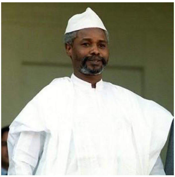
for war crimes.

Chadian President Hissene Habré on an official visit in Paris (file photo)