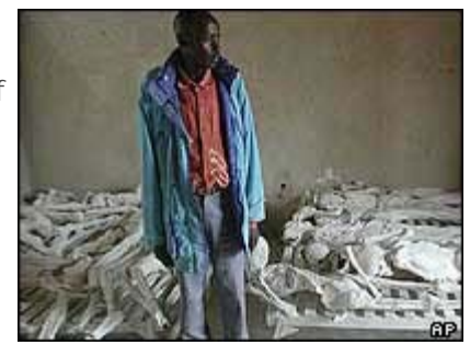
Some 800,000 people were killed during the 1994 genocide

The ICTR, which is based in Arusha, Tanzania, has completed 47 cases.