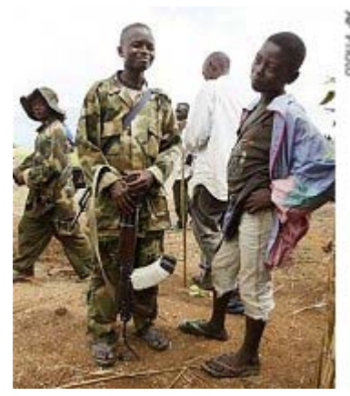
Child solders stand talking near the small village of Boga near Bunia, Democratic Republic of Congo (2004 file photo)

An international human rights group says child soldiers as young as 13 are serving in the army of the Democratic Republic of Congo. Human Rights Watch is urging the Congolese government to release the estimated 300 to 500 youngsters, whom they inherited when they absorbed the armies of former rebel warlords under terms of a peace plan. The Congolese situation is not unique. The United Nations estimates that 300,000 children serve as indentured soldiers in rebel and government armies around the world. VOA's David McAlary reports from Washington that if the youngsters survive their ordeal, they are usually left with severe psychological wounds.