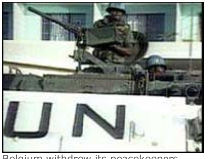
Belgium withdrew its peacekeepers after the murders

She was later murdered by soldiers and militiamen for being a moderate.