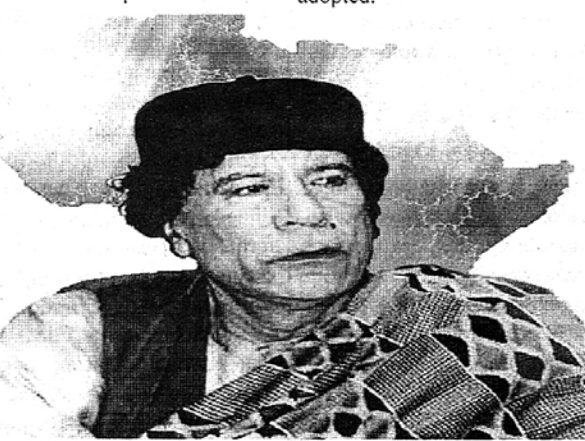
Col. Ghadaffi: the Hitler of Africa

and government military operations, the tactics of ambushes along the highways and hit and run attacks were used creating a state of insecurity was adopted.