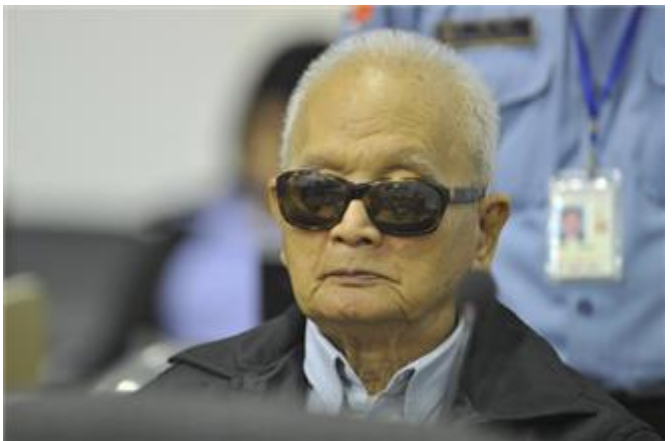
Khmer Rouge 'Brother Number 2' Nuon Chea

Many victims have attended the court's public gallery, which has seating capacity for 500. Most never imagined they would ever get the chance to see their tormentors, top leaders of the regime, finally brought to court.