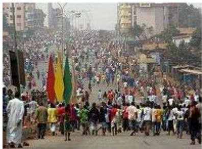
Protesters march during a demonstration, part of a general strike in Conakry, 22 Jan 2007

Clashes in Guinea between protesters demanding the president's resignation and security forces claimed at least 20 lives and led to dozens of injuries. VOA's Nico Colombant reports from our regional bureau in Dakar.