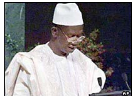
Strongman feels the heat