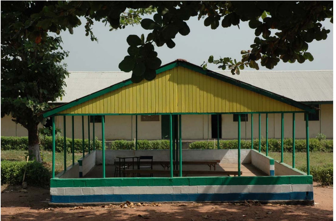
Pavilion at St. Francis Secondary School in Makeni