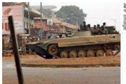
Soldiers in an armored vehicle prepare to face protesters in Conakry

Most of the shooting took place midday when waves of protesters