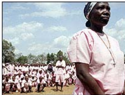
The gacaca courts were supposed to bring reconciliation

The Arusha tribunal has convicted just 27 people and is due to wind up in 2008, when most cases are likely to be transferred to Kigali.