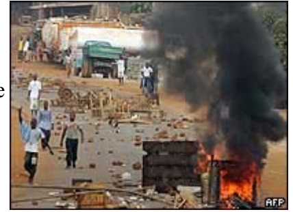
The strikers were prevented from reaching the city centre

The current general strike is the third in the last year.