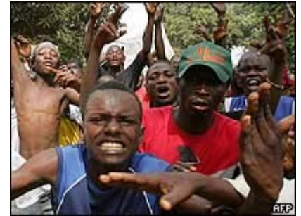
The protesters say they will continue until the president steps down

Mr Ban said he was concerned about the loss of life during the protests.