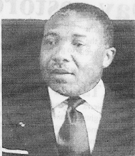
Charles Taylor: Expected in Sierra Leone soon