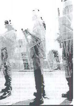
1980 EXECUTION TO FORM PART OF THE DEFENSE

had the power and will to reward those that aid his plans and punish or destroy those that depict him. By the time the crimes charged in this indictment took place, the Accused had well established relationships with those on the ground in Sierra Leone who carried out the crimes. The RUF and its allies