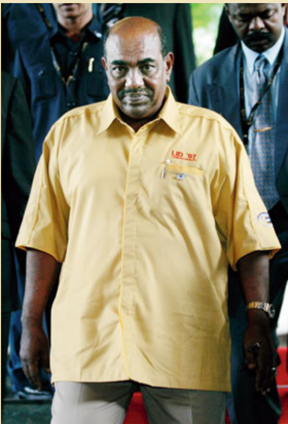
President Omar Al-Bashir.

He is suspected of being criminally responsible ... for intentionally directing attacks against an important part of the civilian population ... murdering, exterminating, raping, torturing, and forcibly transferring large numbers of civilians,