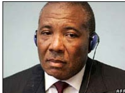
Charles Taylor has pleaded not guilty to charges of war crimes

Sierra Leone's Revolutionary United Front rebels were notorious for mutilating civilians, by hacking off their arms or legs with machetes.