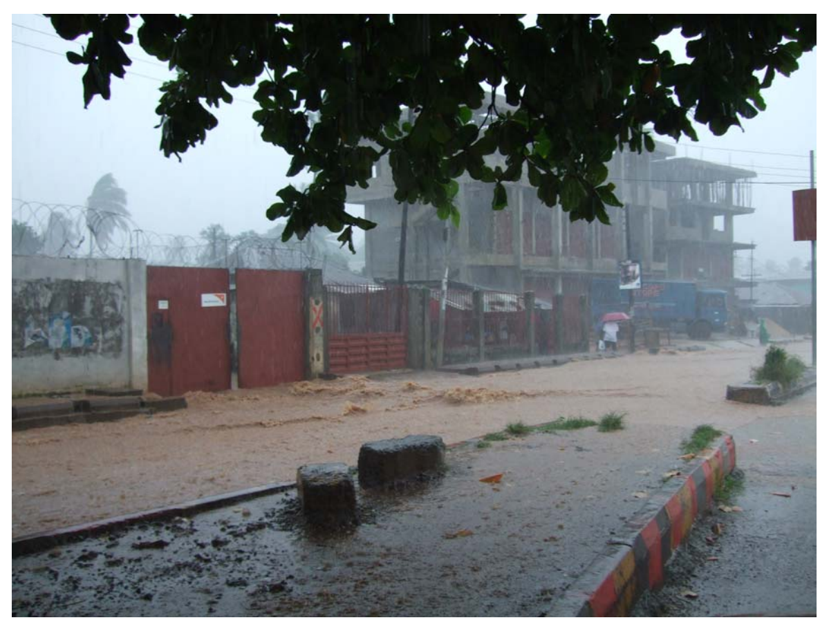
"Singing' in the Rain".