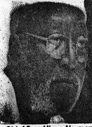
Chief Sam Hinga Norman