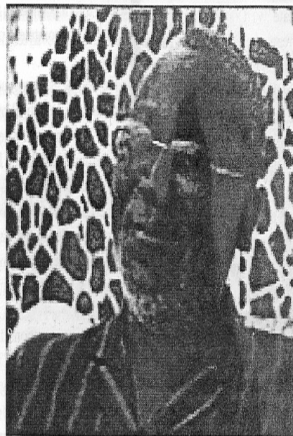
NORMAN:his failing health a cause for concern

struggle for power? Following a request by the country's President Ahmad Tejan Kabbah the UN established a tribunal to try those people said to have wielded power, influence