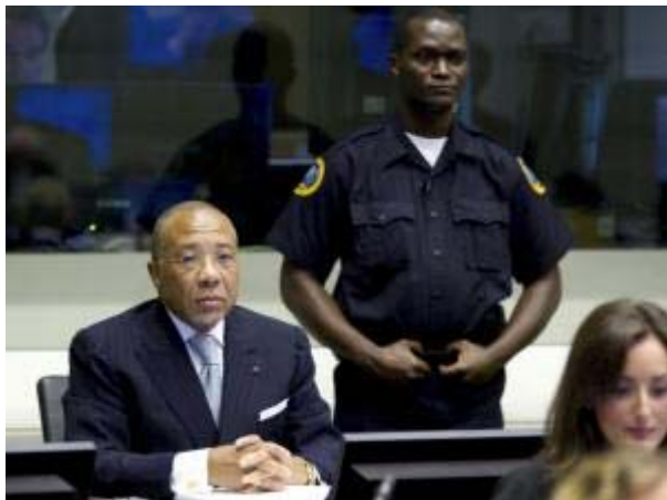
Former Liberian President Charles Taylor, left.