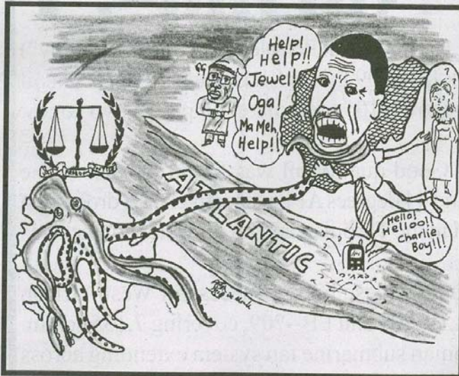
Once upon a time the Special Court for Sierra Leone indicted sitting President of Liberia, Charles Ghankay McArthur Taylor