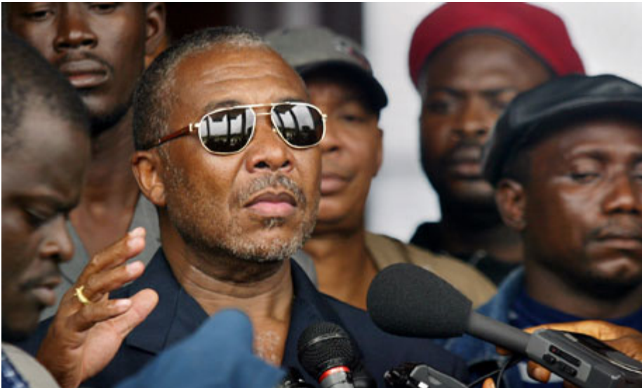
Charles Taylor, pictured in 2003.

The former president of Liberia Charles Taylor is due to appear in a war crimes court at The Hague to learn his fate at the end of a four-year trial and begin a journey that may end in a British prison cell.