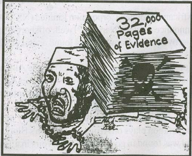
The Special Court for Sierra Leone claimed they have 32, 000 pages of evidence against President Taylor. (E escape tay one mus ketch am)