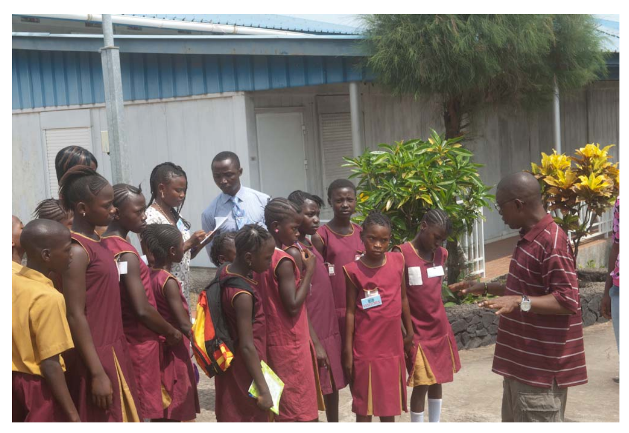
School children and teachers from the Word of Faith Nursery and Preparatory School visited the Special Court today. For more photos, see today's 'Special Court Supplement'.