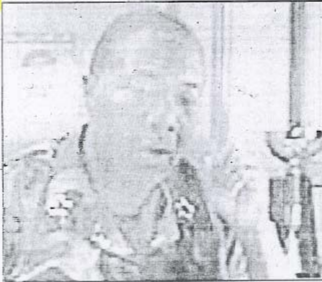
Former Pres. Charles G. Taylor