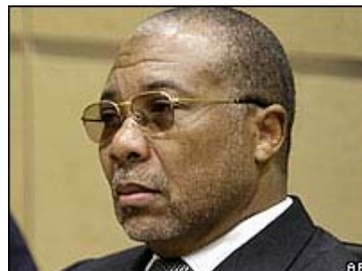
Charles Taylor is accused of stoking the 1991-2001 Sierra Leone war

The ex-Liberian president is accused of responsibility for the actions of RUF rebels during the 1991-2001 civil war in Sierra Leone, which included unlawful killings, sexual slavery, use of child soldiers and looting.