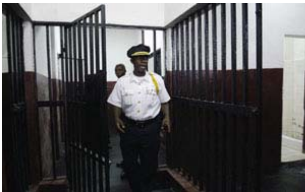
An officer inspects the Criminal Service Department cells