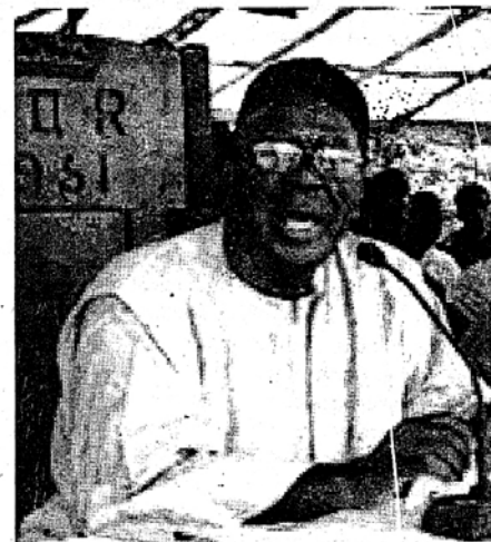
KABBAH: neglected prisons completely

"We want all stakeholders to know that the prisons should be places of correction and not for torture", he said.